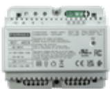
F04826 POWER SUPP. UNIT+FILTER DIN6 24VDC-1.5A