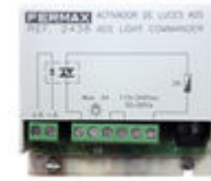
F02438 VDS LIGHT/BUZZER ACTIVATOR