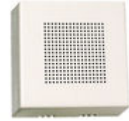
F02040 ELECTRONIC EXTENSION CALL