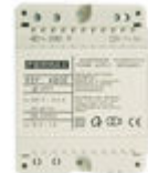
F04802 P.S.U. DIN4 230VAC/12VAC-1A