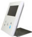
F09420 VEO-XS/VEO-XL MONITOR DESKTOP SUPPORT