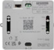
F09454 IP/DUOX PLUS CAMERA INTERFACE