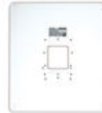
F03389 UNIVERSAL FRAME LARGE