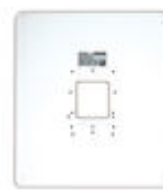
F03389 UNIVERSAL FRAME LARGE