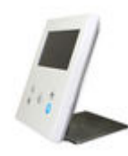
F09420 VEO-XS/VEO-XL MONITOR DESKTOP SUPPORT