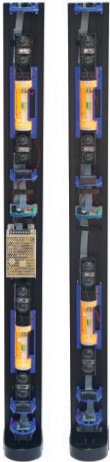
Pre-built 2m Tower

A time saving and simplified solution for installing free-standing and wall-mounted beam towers