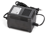
AC24V/3A Power Adapter