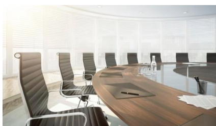
Small Meeting room