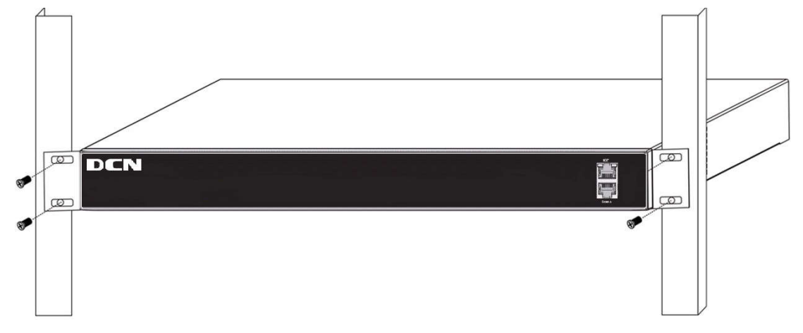
Figure 2-2 The figure of switch installing on the rack by using the front and back horn iron Caution!

There is no back horn iron in standard configuration. If users bought it, the figure of installation is below: