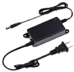
DC12V/2A Power Adapter