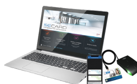
SECARD SECard configuration kit and SSCP® v1 & v2 and OSDPT™ protocols