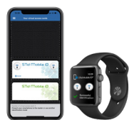
NFC and Bluetooth® Smartphones / connected watches with STid Mobile ID® application