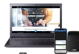
STid Mobile ID Online Portal Web platform for remote management of your virtual cards

* Our readers only read the / UID PICO1444-3B serial number of the iCLASS™ chip. They do not read the cryptographic protections iCLASS™ nor the / UID PICO 15693 serial number of HID Global.