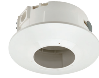
SHP-1680F / SHP-1680FW