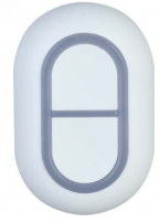
Wireless Panic Button