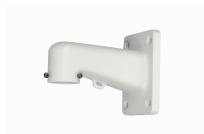
DH-PFB305W Wall mount bracket