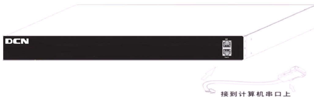
Fig 2-3 Connecting Console to switch

switch provide a serial RJ45 console port.