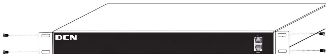
Figure 2-1 switch install sketch map on the rack using stock