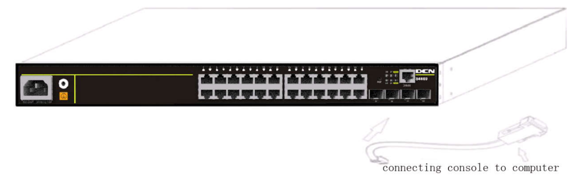
Fig 2-3 Connecting Console to switch

S4600 series provide a RJ45 serial console port.