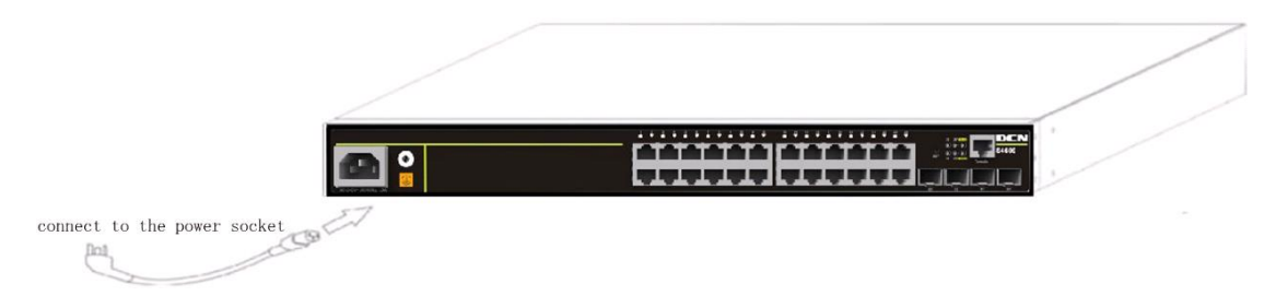
Fig 2-4 Connecting power to switch

1. Insert one end of the power cable provided in the accessory kit into the power source socket (with overload and leakage protection), and the other end to the power socket in the back panel of the switch.