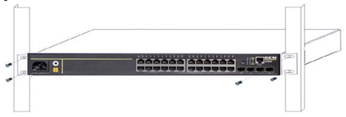
Fig 2-2 Fasten the Switch to the Rack

2. Put the bracket-mounted switch smoothly into a standard 19" rack. Fasten the switch to the rack with the screws provided. Leave enough space around the switch for good air circulation.