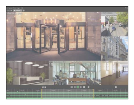
THE VMS PIONEER: BENEFIT OF OVER 20 YEARS OF EXPERIENCE AND INNOVATION TO SECURE THE FUTURE OF COMPANIES AND CITIES.